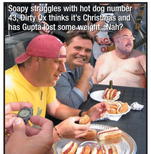
Soapy struggles with hot dog number 43, Dirty Ox thinks it's Christmas and has Gupta lost some weight...Nah?

'Soapys' best effort (shown below) was 45 hot dogs followed by a stomach pump.