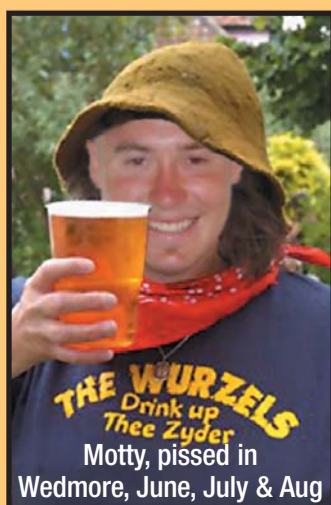
THE WURZELS Drink up Thee Zyder Motty, pissed in Wedmore, June, July & Aug