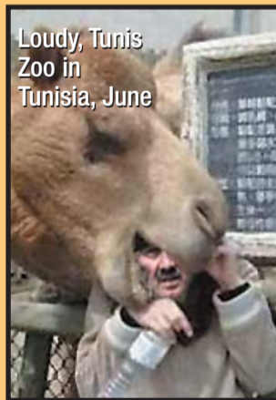
Loudy, Tunis Zoo in Tunisia, June