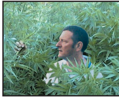
'Buckers' inspecting his back garden crop of Ganja earlier this month.

Prosecution for Buckley who uses several aliases including