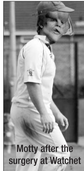
Motty after the surgery at Watchet