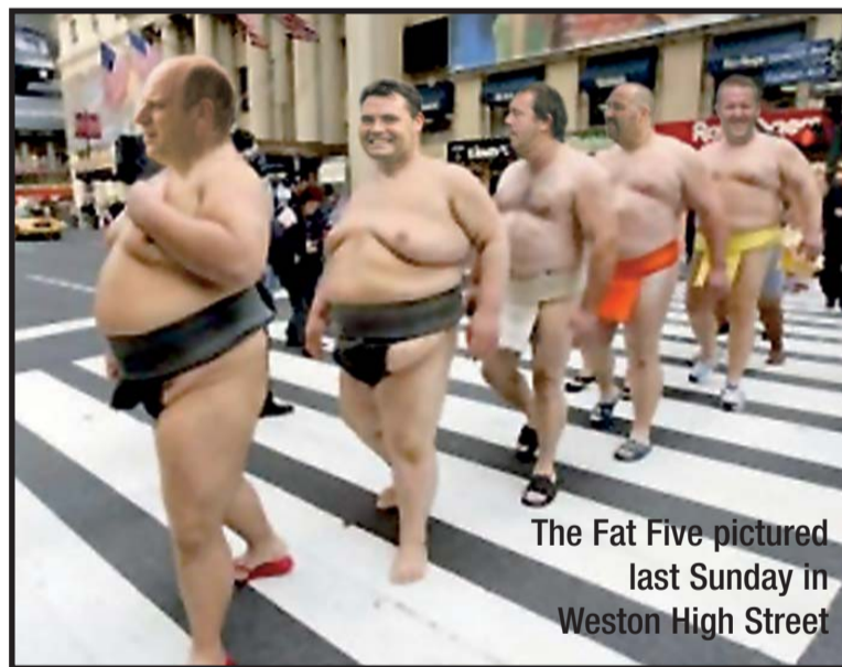
The Fat Five pictured last Sunday in Weston High Street